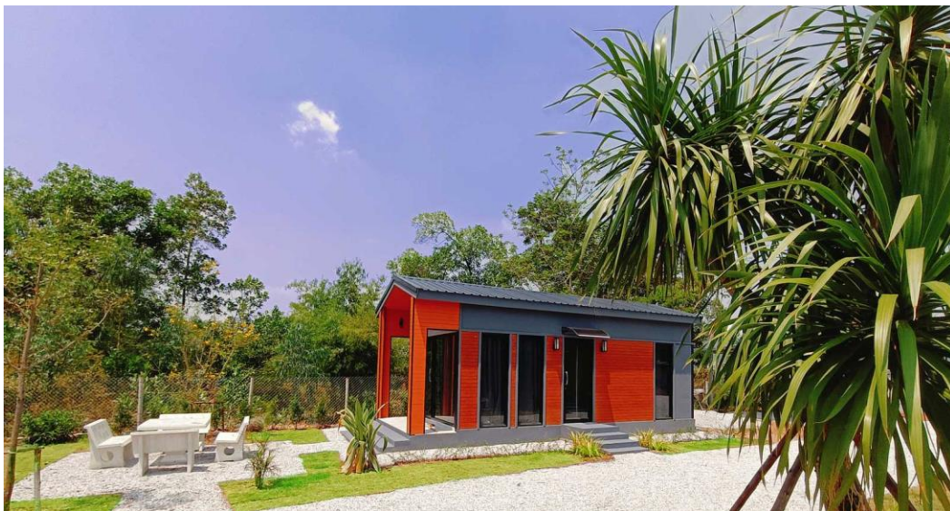
Hornduk Garden Bungalows with private garden

Hornduk also offers drinks and food, with Thai favourites being cooked to order and delivered to your room, with dishes costing no more than they would in a simple roadside market shop.