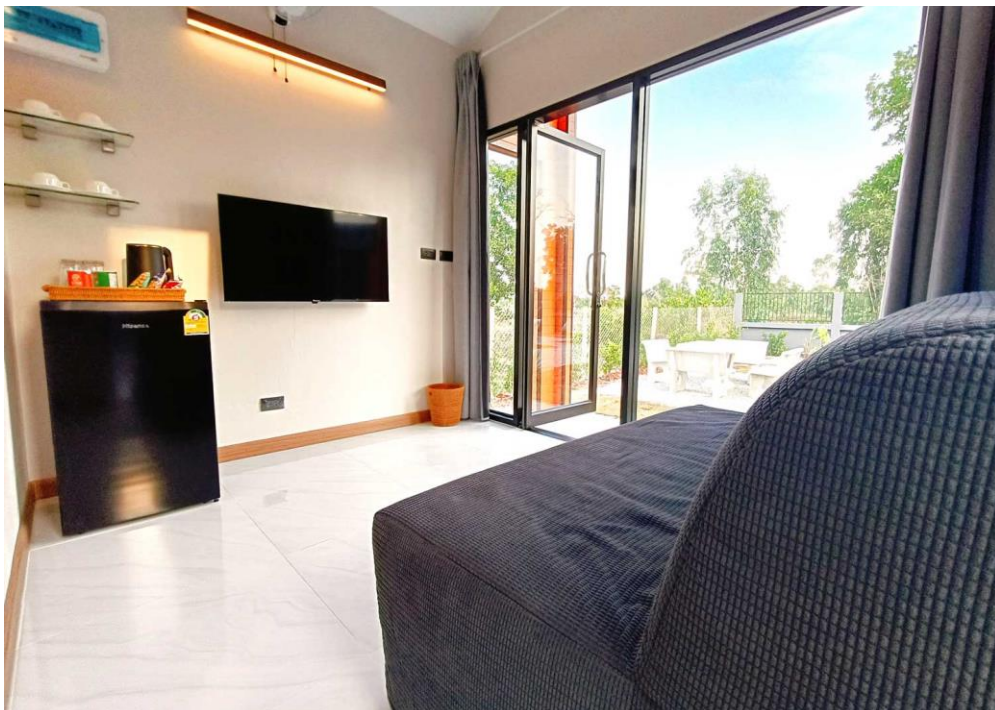
Adjoining living room with smart TV and refrigerator, as well as a sofa bed for additional guests.