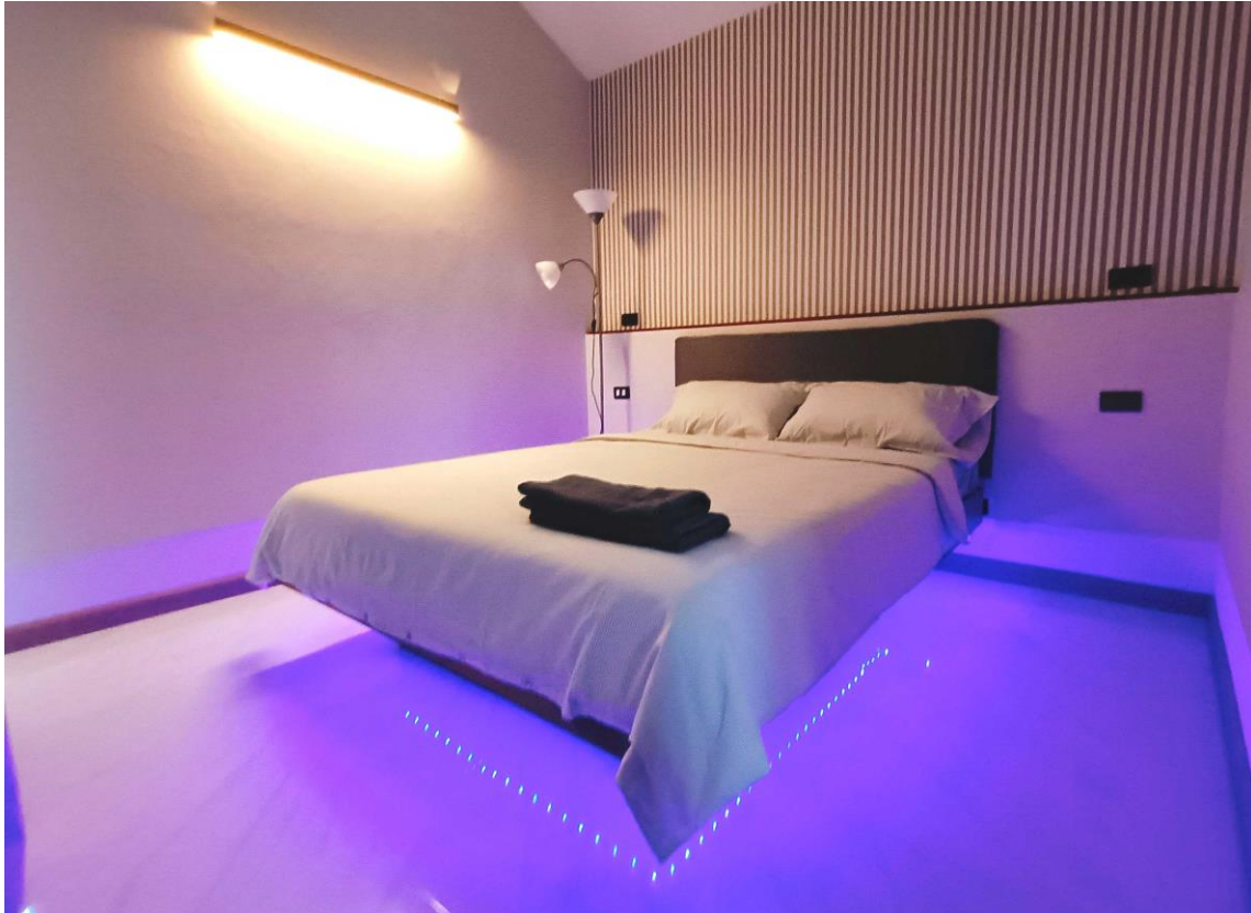
Floating bed in air-conditioned bedroom at Hornduk Resort